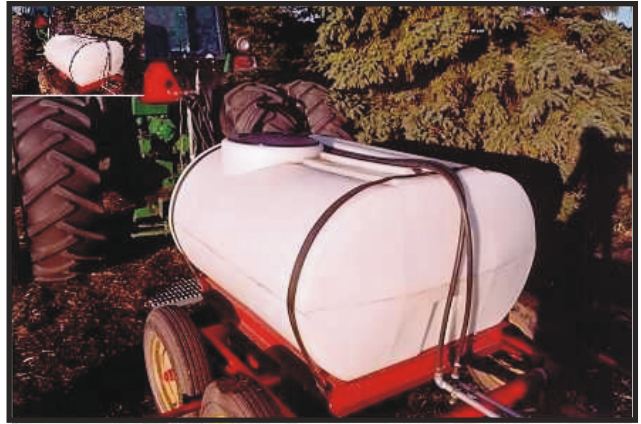
PHOTO: 300 Imp. Gallon Sprayer